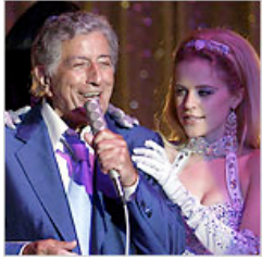
In the Spotlight, a Lifetime of Song