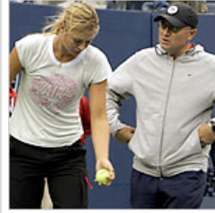
Araton: Coaching in Matches