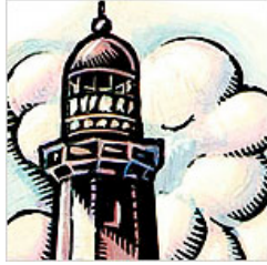
The Montauk Lighthouse