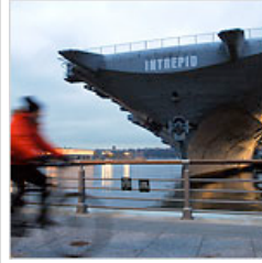
Bill to Move Intrepid Rises to $60 Million